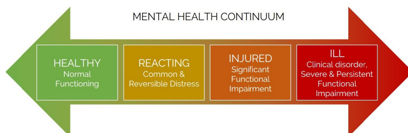
FIG 2. Mental health continuum